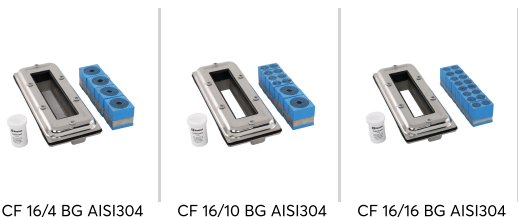
CF 16/4 BG AISI304